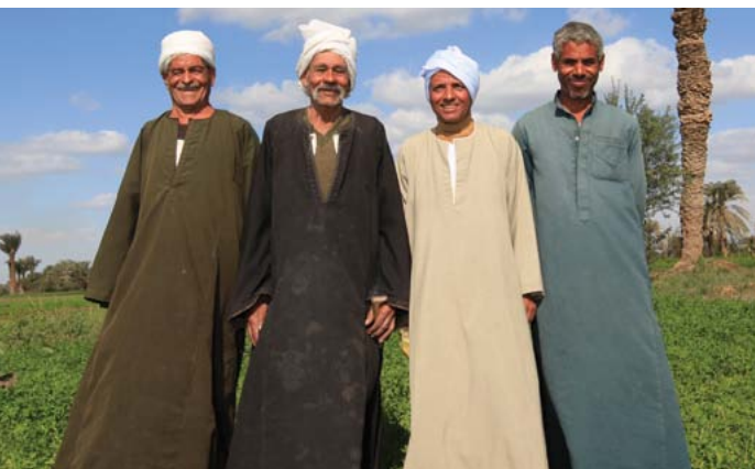
In Egypt, Cargill is collaborating with CARE to introduce soybeans as a new crop. The three-year project focuses on increasing crop yields and improving market access to generate higher profits for farmers, while conserving water and restoring soil fertility.

60% In China, where agricultural irrigation water accounts for more than 60 percent of the country's annual water consumption, Cargill is working in cooperation with the government to improve farm irrigation in rural areas to conserve water, increase crop yields and, as a result, farmer incomes. The project helps farmers in Henan, Sichuan and Xinjiang provinces, which have been hit by drought.