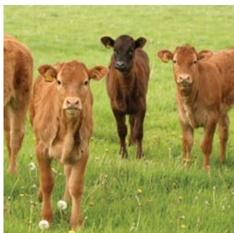
SUSTAINABLE BEEF As global meat consumption continues to rise, Cargill and other leaders in the beef industry – in collaboration with the World Wildlife Fund – formed the Global Roundtable for Sustainable Beef in 2012 to help reduce the impact of beef production on the environment.

Cargill is collaborating with two NGOs to set a new industry standard on fuel efficiency for chartering vessels. Since June 2012, we have been evaluating each ship’s environmental performance as part of our decision-making process in chartering vessels using the Existing Vessel Design Index fuel efficiency ratings system, which indicates a ship’s GHG emissions and energy efficiency. Cargill carried about 190 million metric tons of commodities on chartered vessels in 2011. Now, some of those charters will be diverted away from the