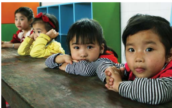
In Vietnam, we have built 56 Cargill Cares schools serving more than 12,000 children – the most recent is the Nga Dien Kindergarten in the Thanh Hóa Province, which opened in May 2012. Access to education is essential in this growing country with a high population of young people. By 2015, we aim to build 75 schools reaching 17,000 children.