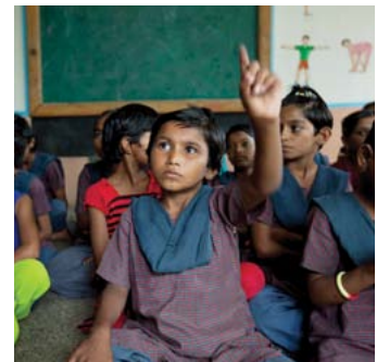
KEEPING KIDS IN SCHOOL Cargill and CARE have helped nearly 35,000 children – at risk of becoming child laborers – to graduate from primary school. We are working with CARE to improve educational opportunities for children in Honduras, Guatemala, Nicaragua, Ghana, Côte d'Ivoire and India.

School to accommodate more students – now 1,100 – including building several new classrooms, a computer laboratory, an English teaching center and sanitation facilities, along with a bus to transport the girls to school. Our employees also helped purchase bicycles and winter uniforms for students. In Gurgaon, India, we fund all school expenses and have improved buildings at the Pragati Vatika school that serves more than 300 children of daily wage laborers; our employees volunteer there as teachers and mentors. In Central America, our employees have constructed 49 classrooms, while our work with CARE helps ensure nearly 10,000 students in some of the poorest communities have access to education. In Argentina, we built an incubation and hatching room within the poultry production process facility at Fortín Olavarría Agro-technical High School No. 1, located near a Cargill grain elevator, to expand education options for students while increasing production of food that is consumed at the school and donated to neighbors in need. In China, we continue to provide funding for the China Children and