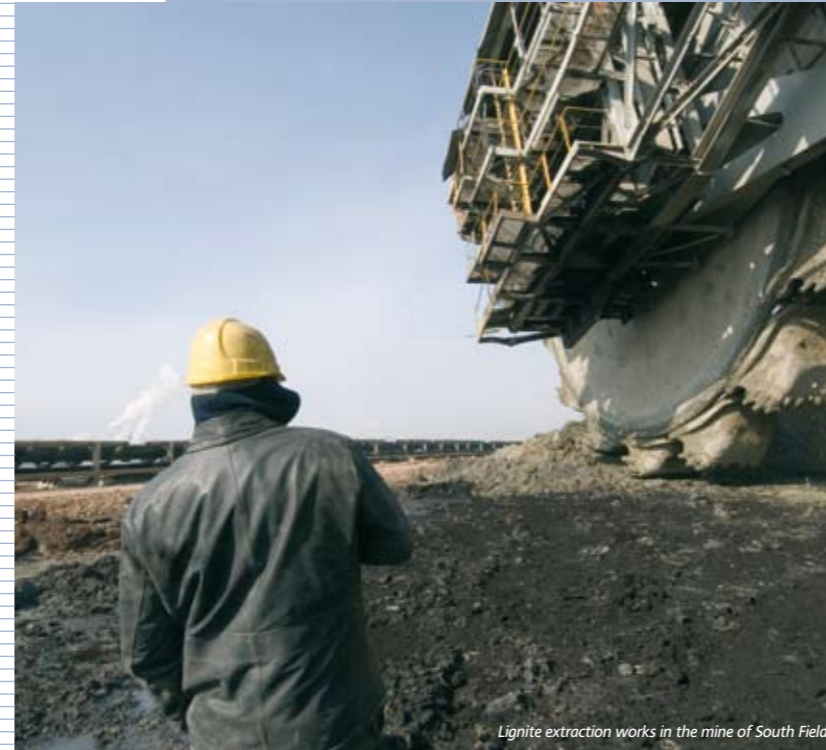
Lignite extraction works in the mine of South Field