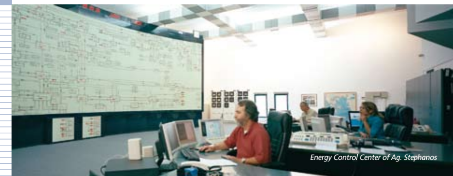
Energy Control Center of Ag. Stephanos