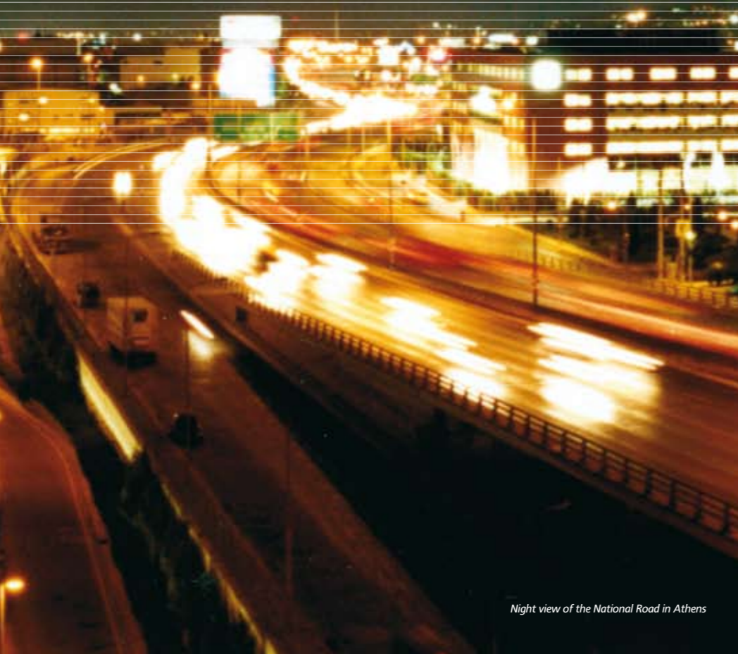
Night view of the National Road in Athens