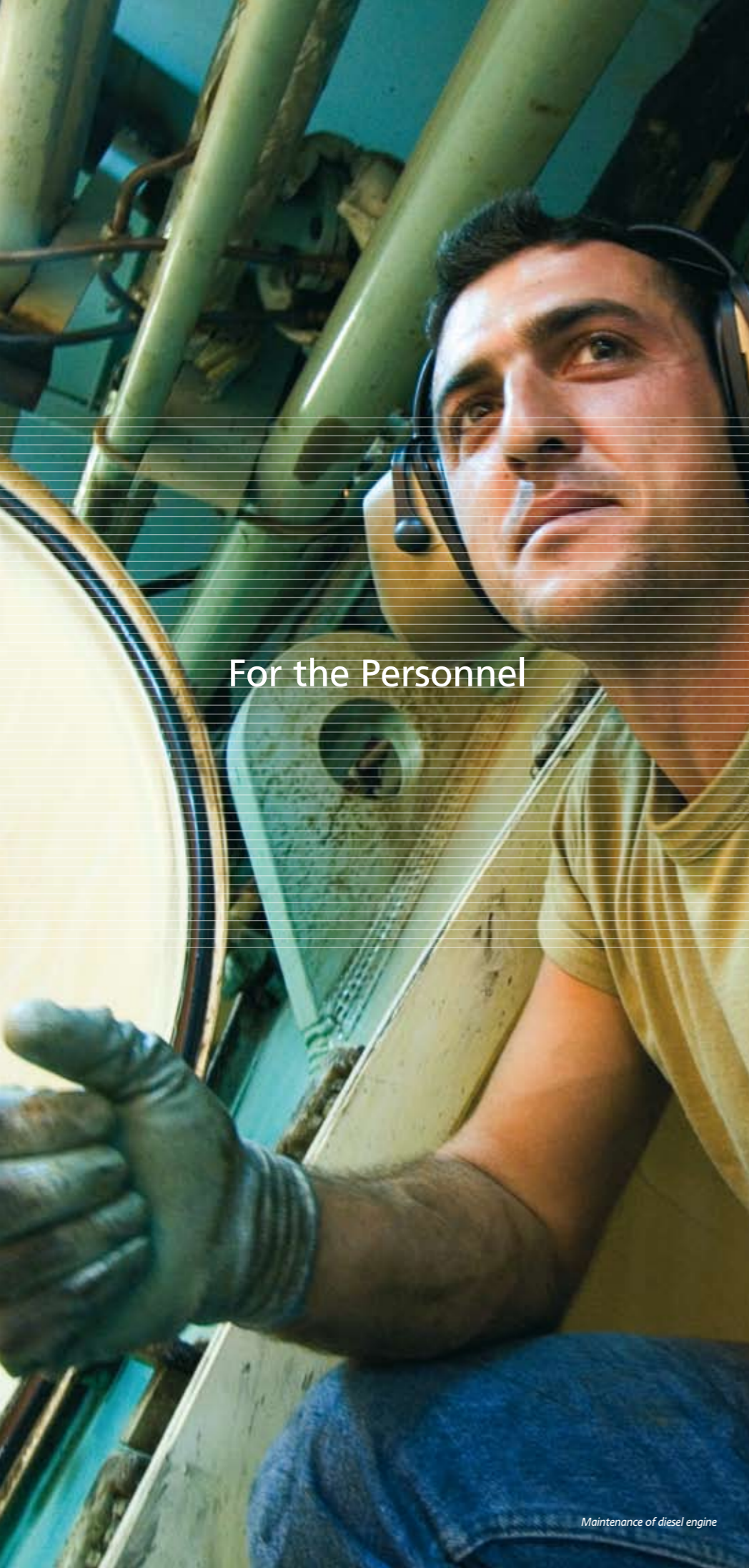
Maintenance of diesel engine