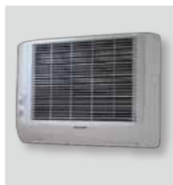
"CUBE", the split air conditioner being sold in India.