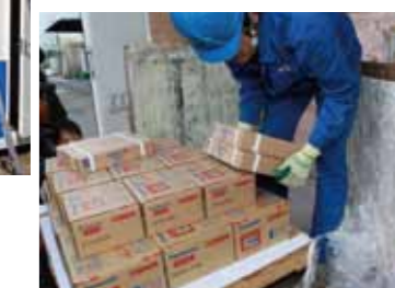
3,660 emergency medical-use dry cell batteries sent to Sendai.