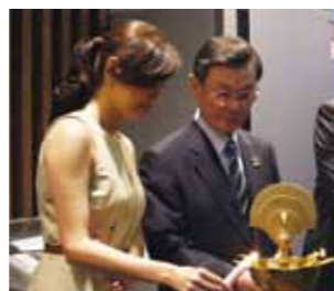
Opening ceremony of Panasonic Experience Center, Mumbai. Actress Dia Mirza and President Ohtsubo.

While a growing number of people in India are now looking for a higher standard of living, there is also a growing concern about the environment. The "CUBE" Air Conditioner launched in December 2010 was the result of detailed market research performed by an R&D team comprising mostly of local employees. It is thus able to successfully fulfill the local customers' needs for reasonable pricing, energy efficiency, and lower noise level. At the Panasonic Experience Center in Gurgaon, the suburbs of Delhi, we showcase a safe, comfortable, and enjoyable lifestyle through Panasonic products and introduce people to our environmental activities and management philosophy. At the Panasonic Techno Park, our consolidated manufacturing facility scheduled to open in 2012, we will thoroughly focus on environmental technologies such as solar power generation, zero emission technologies etc.