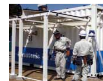
Life Innovation Container donated to tsunami-ravaged Minami Sanriku Town in Miyagi Prefecture.

that this nothing less than the fulfillment of our management philosophy through recovery from this disaster.