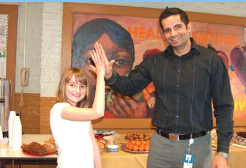
▲ Volunteerism is an integral part of the Manpower culture. In 2008, Manpower employees performed nearly 38,000 hours of community service through local involvement with organizations of their choosing and through corporate activities.

Last year much of the world was beginning to feel the full effects of the global recession. But despite the downturn in the economy, Manpower remained true to our values and our commitment to deserving causes in the communities we serve. In 2008, that support included the combined donations of $2,729,117 to charities and other organizations in need of assistance.