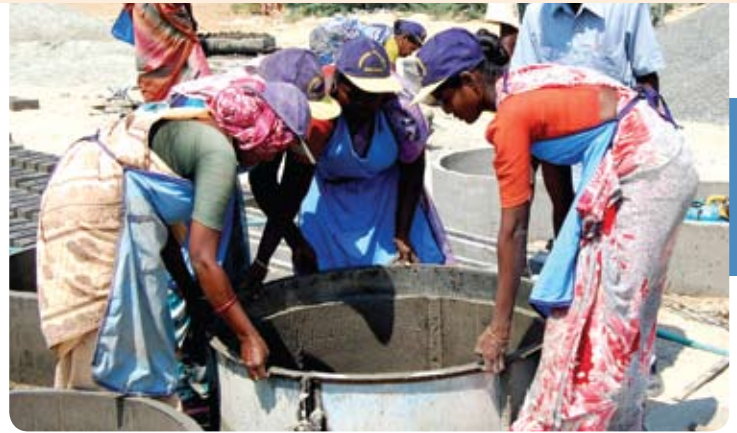
▲ The Manpower Vocational Training Center in Tamil Nadu, India, provides women with an opportunity to train for higher-paying occupations that were traditionally held exclusively by men.

At the Manpower Vocational Training Centers (MVCT) in the Nagapattinam district of India, we have noted an encouraging development. In a culture that has traditionally placed more emphasis on vocational opportunities for men, women are attending classes at the MVTC in increasing