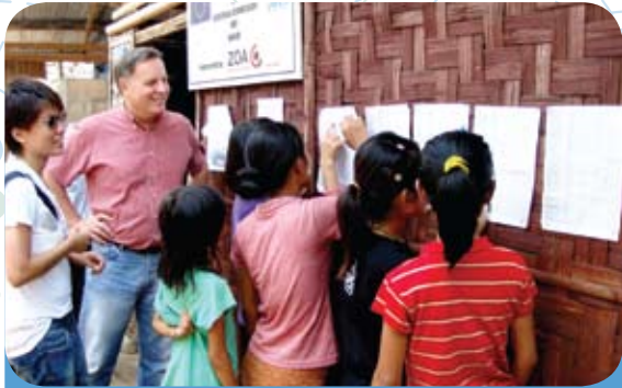
Manpower is working with the United Nations High Commissioner for Refugees to provide jobs for refugees planning to settle in the United States.

Organizational health and resilience are also the goals of our Jefferson Wells subsidiary. It offers clients professional services in the areas of risk advisory, tax, finance and accounting. These are the building blocks of transparency, good governance and sustainability for business, and this is where Jefferson Wells excels.