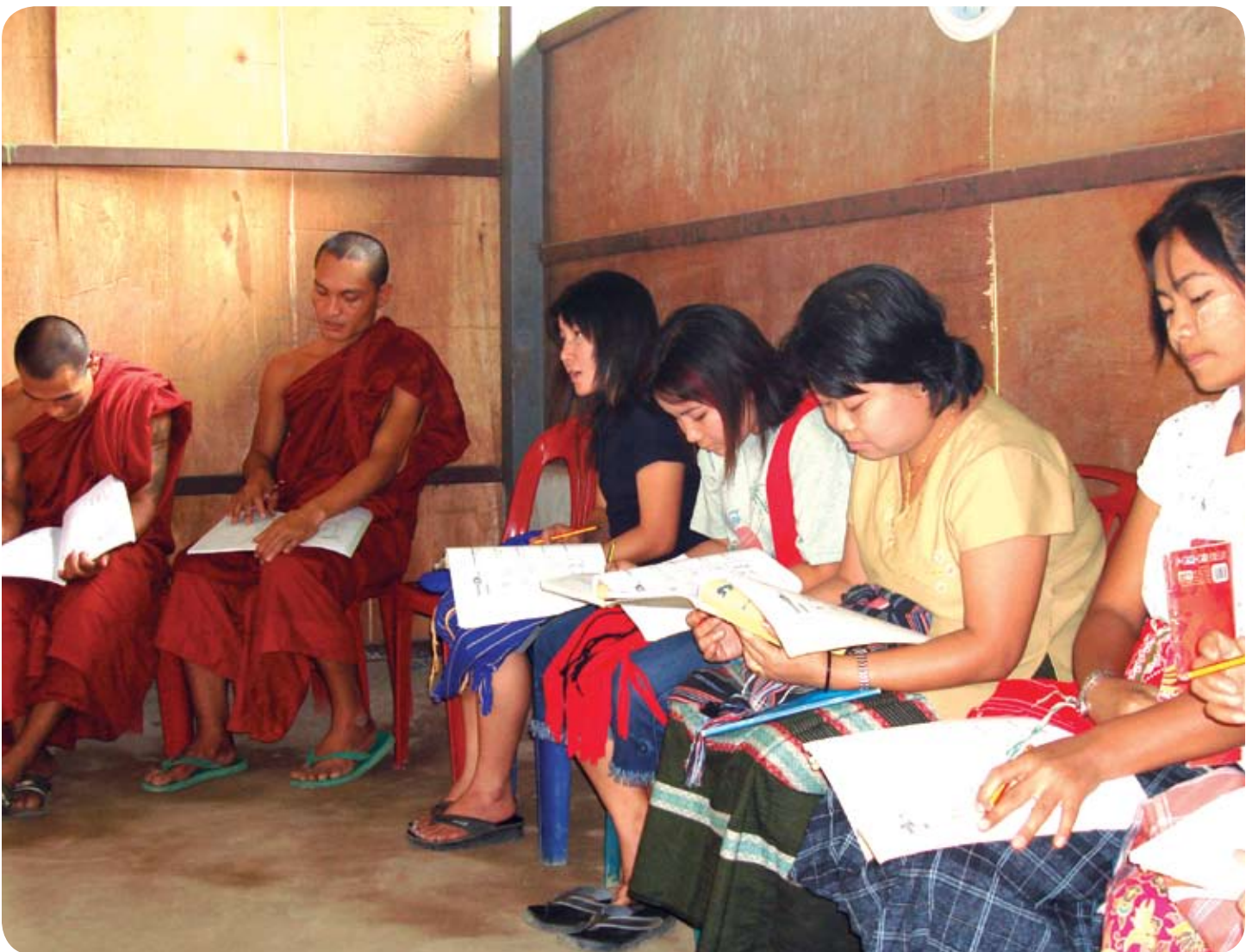
▲ Temporary residents of Thailand's Mae La refugee camp learn English-language skills prior to settlement in the United States. Upon arrival Manpower will help them find jobs.

Today's depressed labor market is masking a development that is certain to impact organizations of all sizes in the near future. As each of us confronts the challenges posed by the current economic climate, it is hard to imagine that a talent shortage of unprecedented proportion lies just beyond the horizon. But it does.