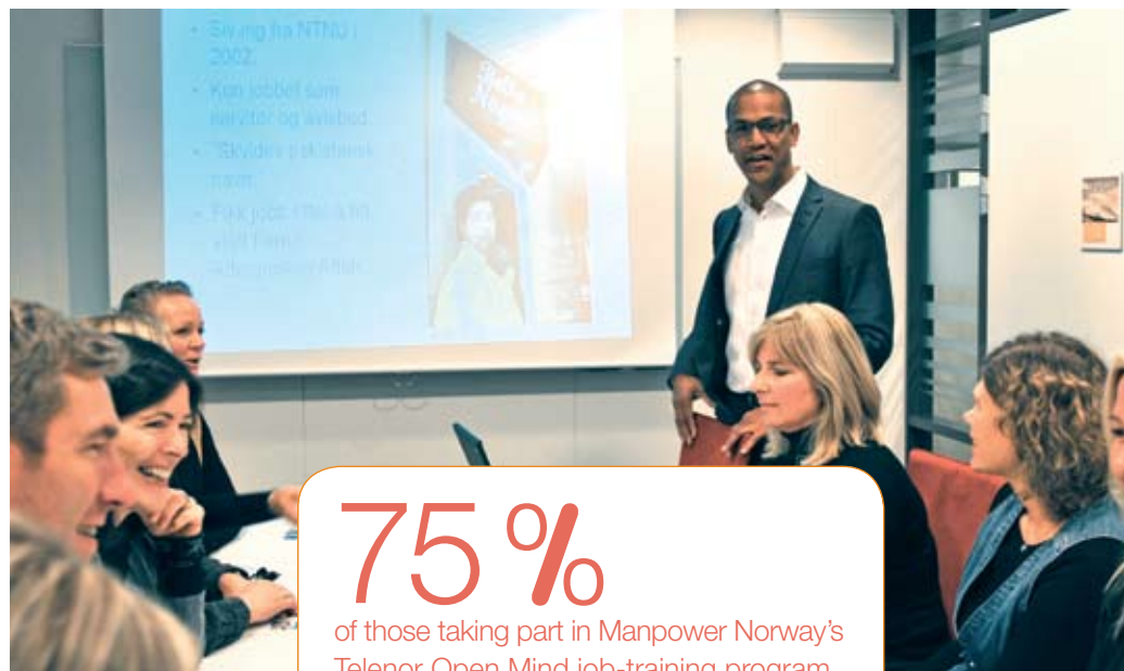
▼ Norway's Telenor Open Mind Program helps dispel the myths about the capabilities of workers with disabilities.

75% of those taking part in Manpower Norway's Telenor Open Mind job-training program have leveraged the opportunity to find permanent positions with Telenor and other organizations.