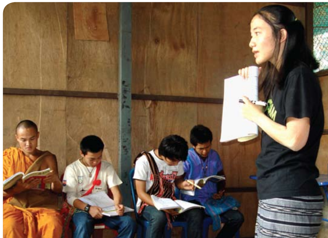
▲ In Thailand's Mae La refugee camp, Manpower representatives work with residents to help them learn English-language skills. Once it is determined where in the U.S. the refugees will settle, a local Manpower team provides the guidance and support they need to find meaningful, sustainable work.