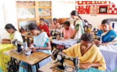
Students master advanced sewing techniques at the Manpower Vocational Training Center in Tamil Nadu, India.