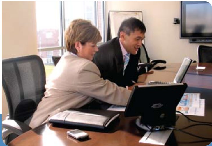
◀ In 2008, Manpower Inc. launched a global supply chain initiative program to help our vast network of suppliers to do business in a manner consistent with our established culture and values.