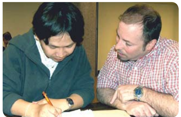
▲ Manpower dedicates time and resources to programs that help young people gain marketable skills.

Early in 2009, Manpower joined efforts with Silatech, a Qatar-based social organization whose mission is to create much-needed jobs and other economic opportunities for young people throughout the Middle East and North Africa. Jobless rates reach 50 percent in many of these areas, and an additional 100 million young people are expected to enter the workforce in the next 15 years. Manpower will leverage its global expertise to help Silatech deliver demand-driven and market-oriented training and job placement for young people across the region.