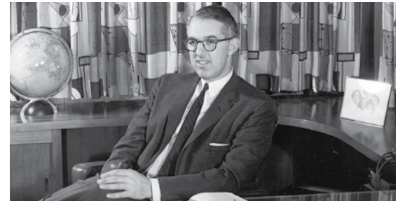
▲ Elmer Winter in 1963.

knowledgeable and effective resource to help them find work and shape their careers. And Manpower will continue to make a difference simply by doing what we do best—providing the training and support that connect people to employment possibilities they may not have otherwise had.