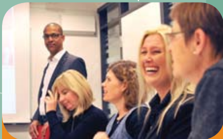
Manpower and Telenor, Norway's leading telecommunications firm, team up to provide task-based training for job seekers.