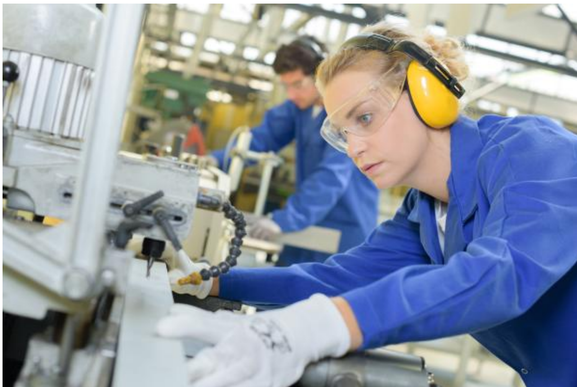
The Green Deal Industrial Plan ( /strategy-and-policy/priorities-2019-2024/european-green-deal/green-deal-industrial-plan_en ).