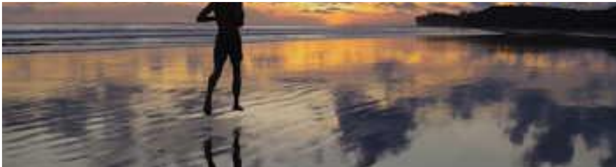
Zero Pollution PackageZero Pollution Package