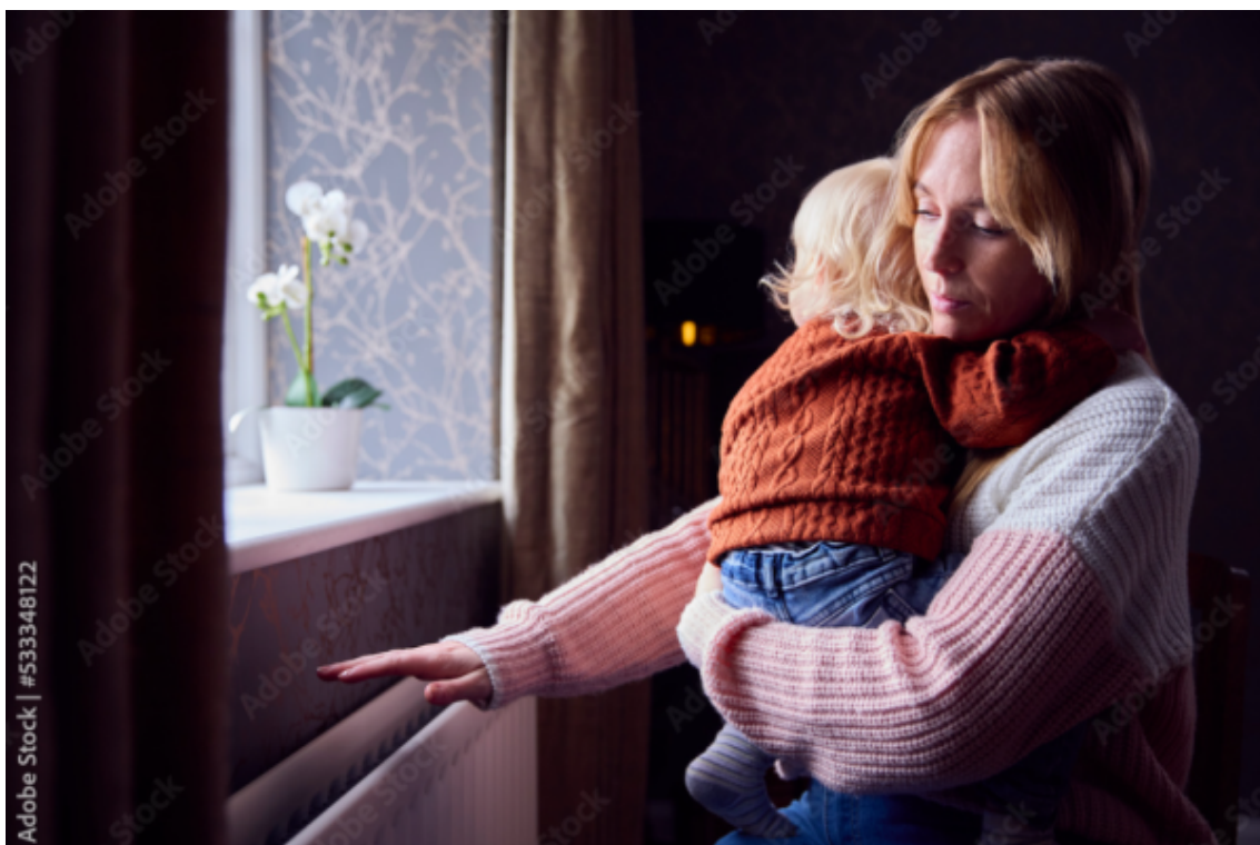
EU action to address energy crisis ( /strategy-and-policy/priorities-2019-2024/european-green-deal/eu-action-address-energy-crisis_en ).